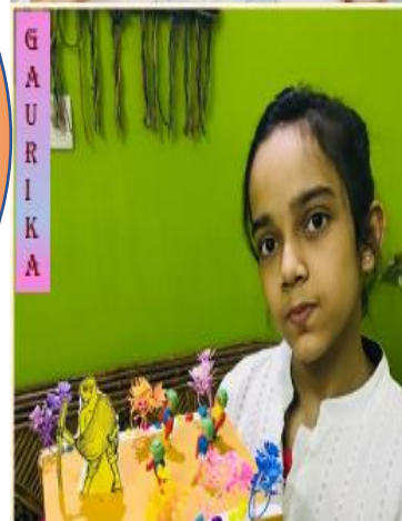
G A U R I K A