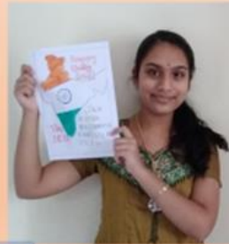
S U K H A D A