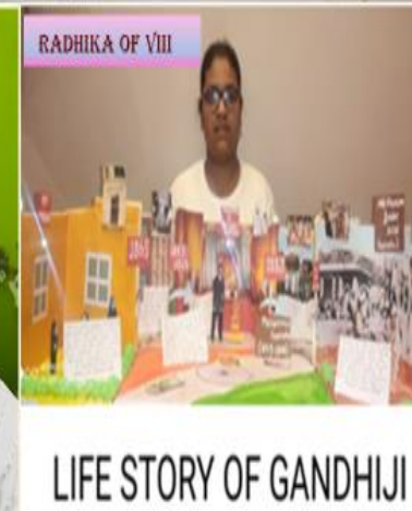
RADHIKA OF VIII