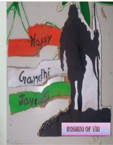
ROSHINI OF VIII