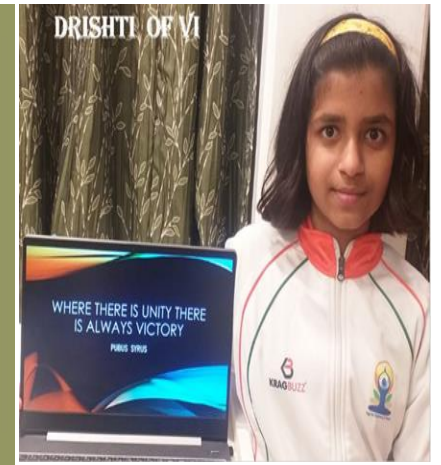
DRISHTI OF VI