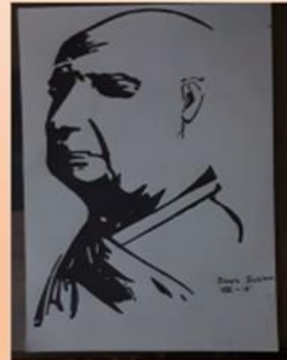
SARDAR VALLABHBHAI PATEL, IRON MAN OF INDIA