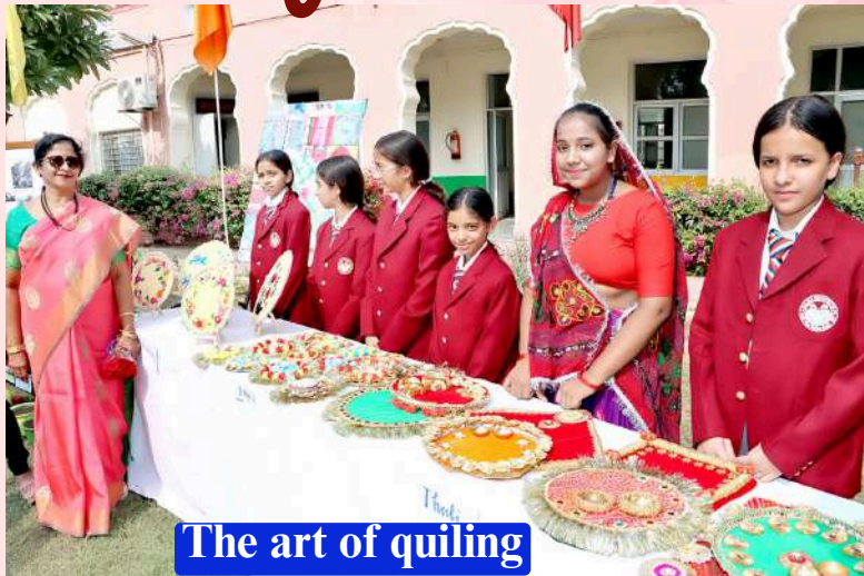
The art of quilting