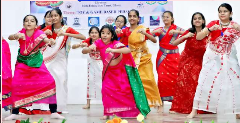
SBGS Team performing a cultural dance, dressed in an attire depicting their state West Bengal