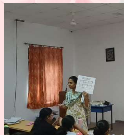
Classroom Teaching with the use of toys, puppets, models, charts, role play