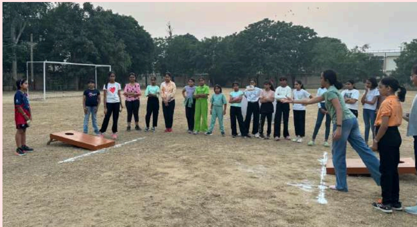
Practicing Cornhole Game on ground by SBGS students