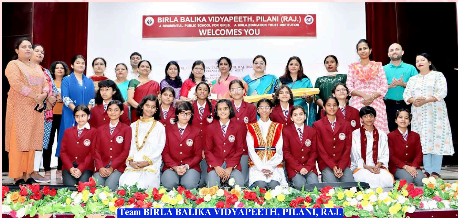
Team BIRLA BALIKA VIDYAPEETH, PILANI, RAJ.

The Grade 6 students of both the schools have participated in a week long Exchange Program. All the students received certificate of participation