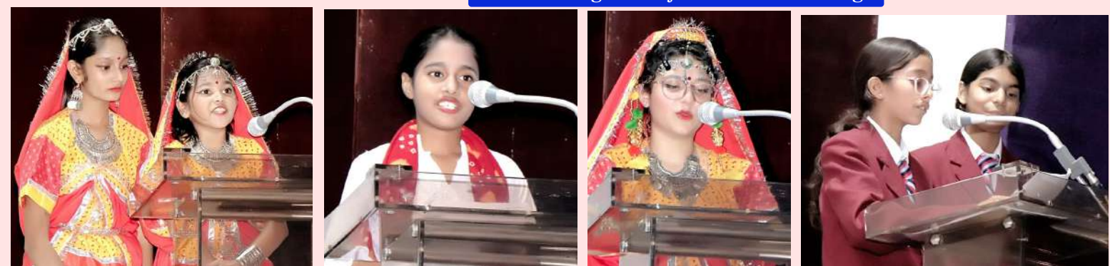
Experience Sharing by the students & teachers of BBV & SBGS