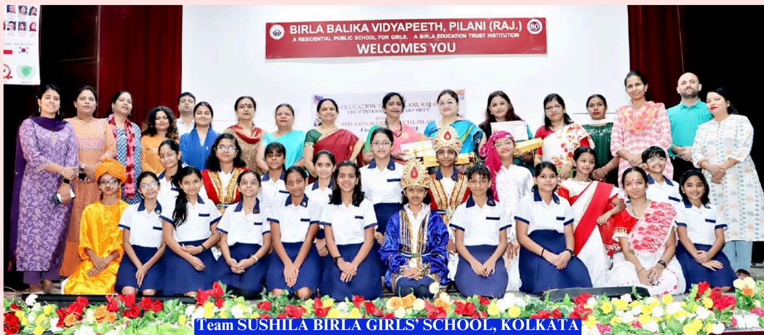
Team SUSHILA BIRLA GIRLS' SCHOOL, KOLKATA

The Grade 6 students of both the schools have participated in a week long Exchange Program. All the students received certificate of participation