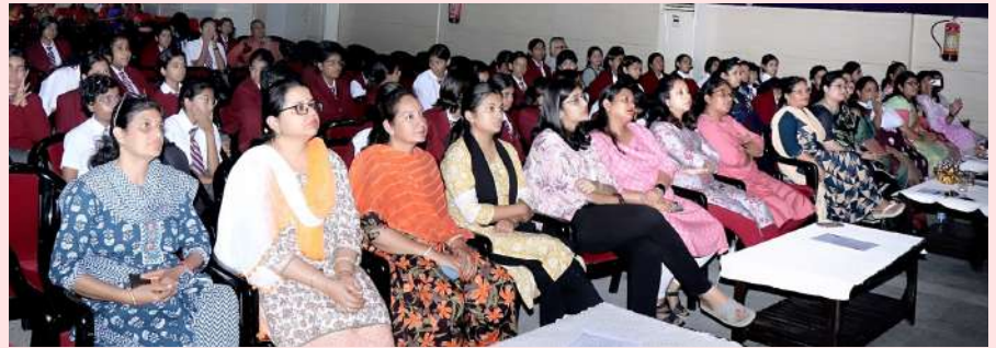
Exchange of Gifts by the students of BBV & SBGS