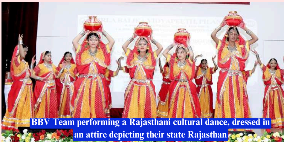
BBV Team performing a Rajasthani cultural dance, dressed in an attire depicting their state Rajasthan

A blend of learning and cultural exchange, fostering deeper bonds and offering fresh perspectives for both schools.