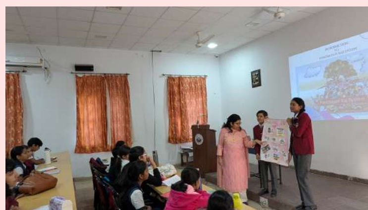
Topics taught with BINGO game, treasure hunt, puzzle etc..