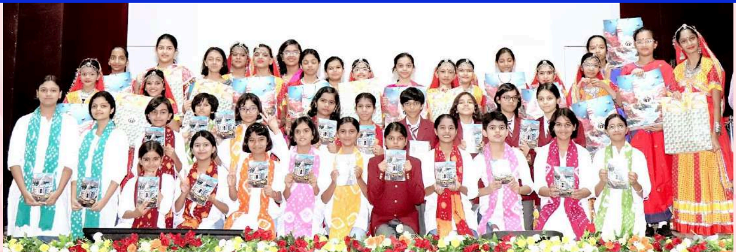
The gifts are exchanged among the two schools, depicting the culture of the respective state (Rajasthan & West Bengal)