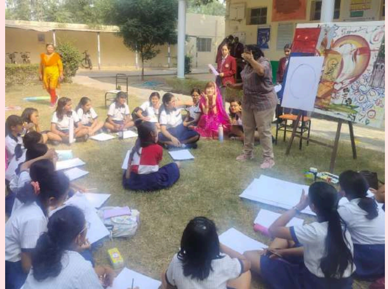
Learning Art Forms in a session with International Artists during ongoing weeklong International Art Meet, hosted by BBV