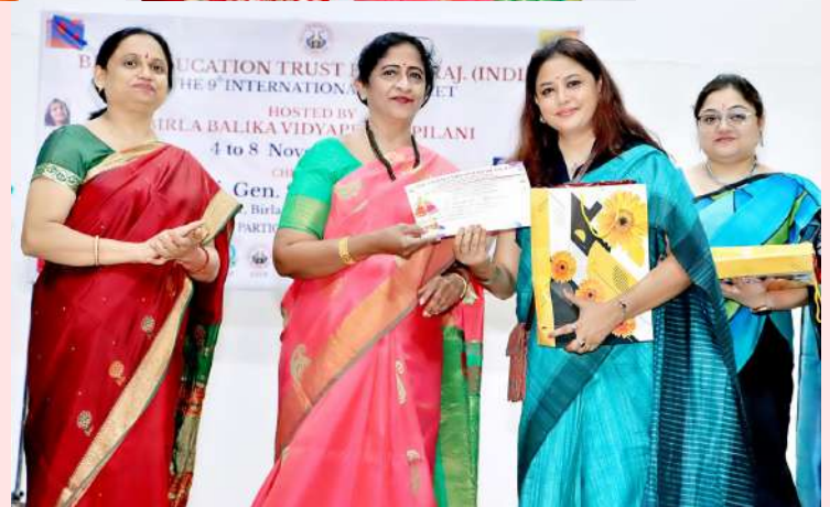
BBV Team sending token to the Director, SBGS; Principal, SBGS & Coordinator. The assistant teachers of SBGS received it on behalf of the authorities.