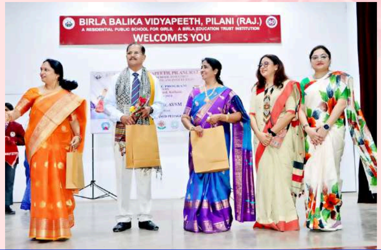
SBGS Team honoring the Director, BET ; Manager, BBV and Incharge Principal, BBV with a token of gratitude