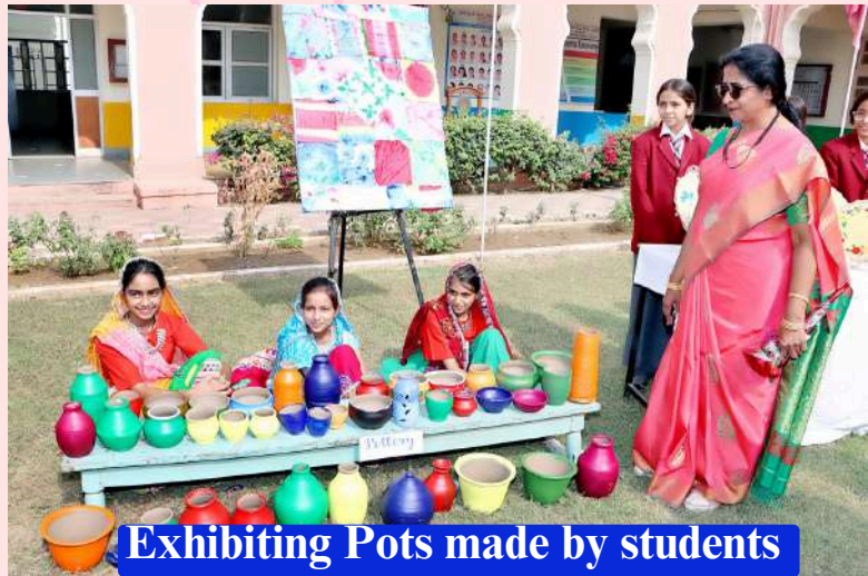
Exhibiting Pots made by students