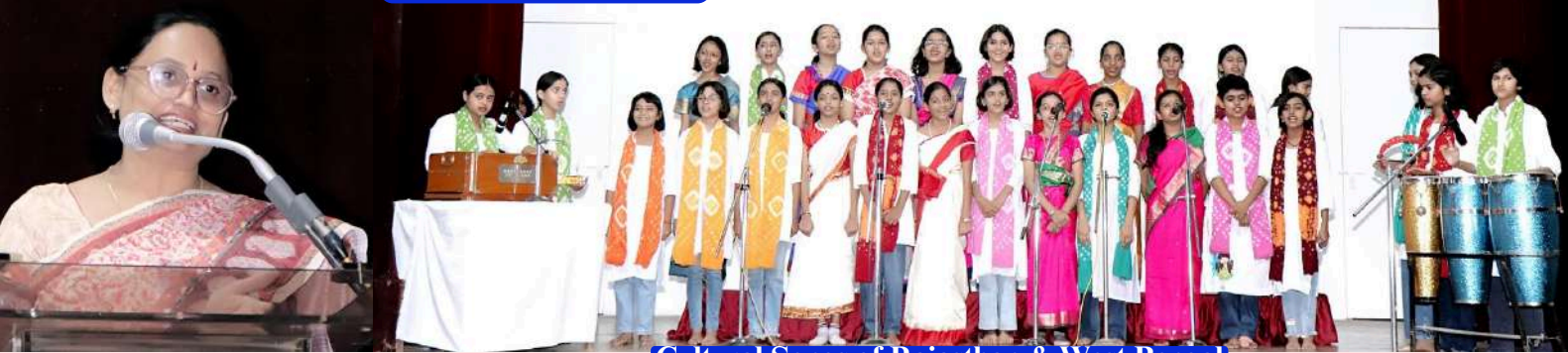
Cultural Songs of Rajasthan & West Bengal