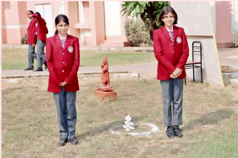
Local Game of 'Pitthu' with usage of stones & ball